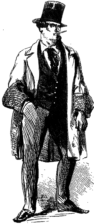
A Bowery Boy.

Reproduced from Frank Leslie's Illustrated Newspaper , July 18, 1857.